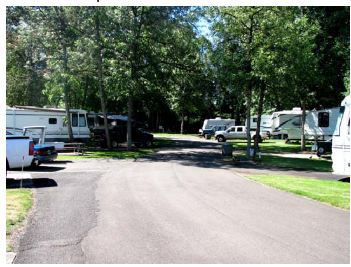
Gill's Landing RV Park Camping Space Fees

The Gill's Landing Campground has twenty-one concrete RV sites. Each site is surrounded by lush green grass and shares a panoramic view of the South Santiam River. All RV sites have 30,40,and 50-amp power supplies. Concrete Walkways provide easy access to the restroom and shower facilities. A short paved trail connects the campground with River Park and provides access to it's various number of special events.