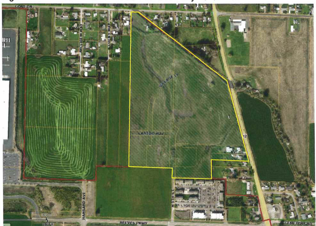
Figure 2 – Mill Race Urban Renewal Plan Boundary Aerial View